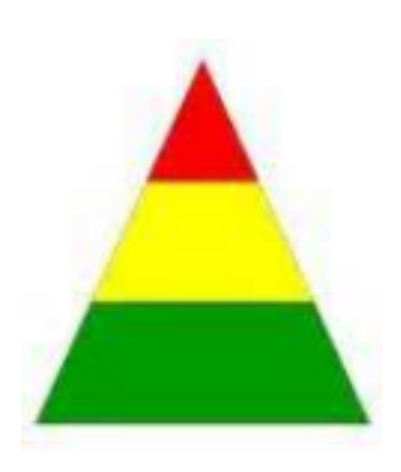
Multi-Tiered Systems of Support

Stone Valley Community Charter School is committed to providing high quality instruction so that each child can make academic progress. To do this, we periodically review information that tells us how each child is progressing. Teacher teams in your school use the Multi-Tiered System of Support process called (MTSS) or "Three tiered Instruction".